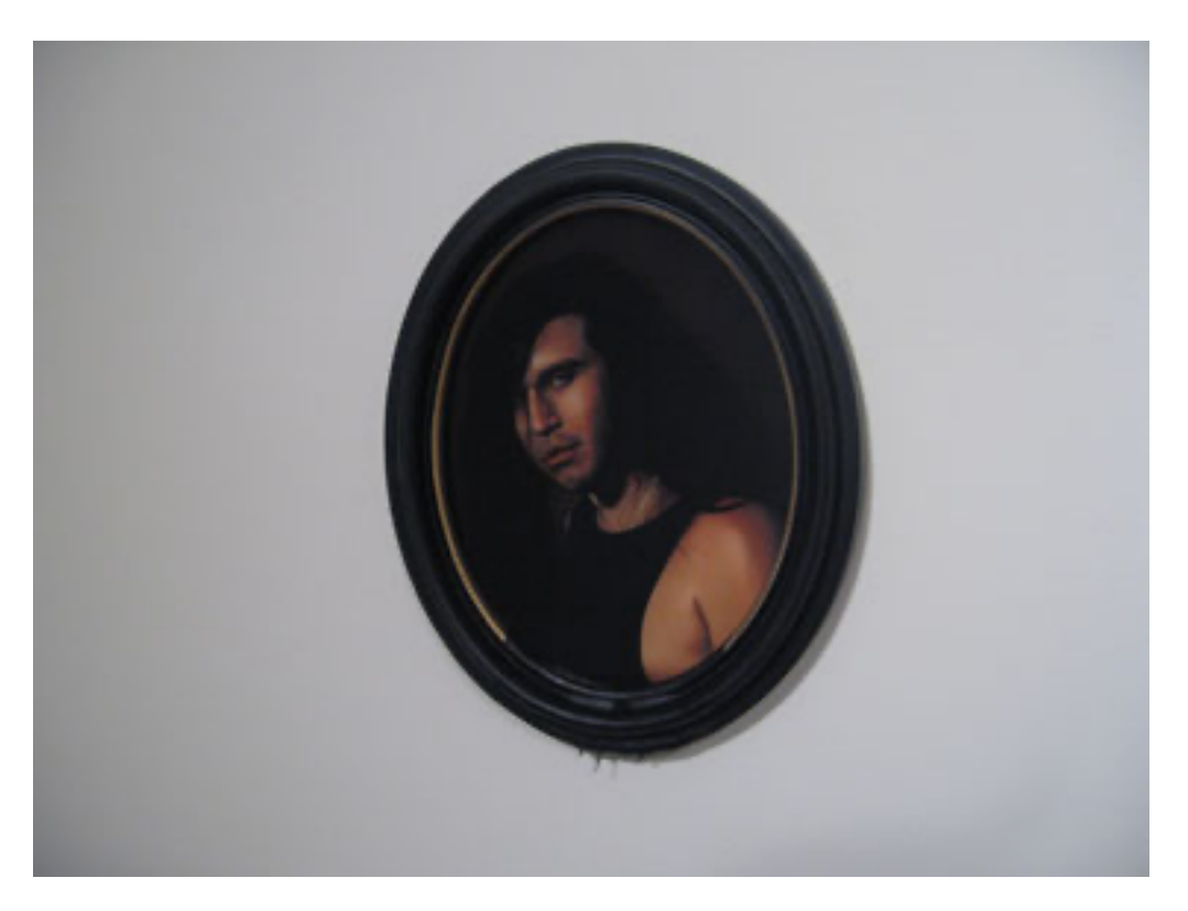
Detail from The Prophets .