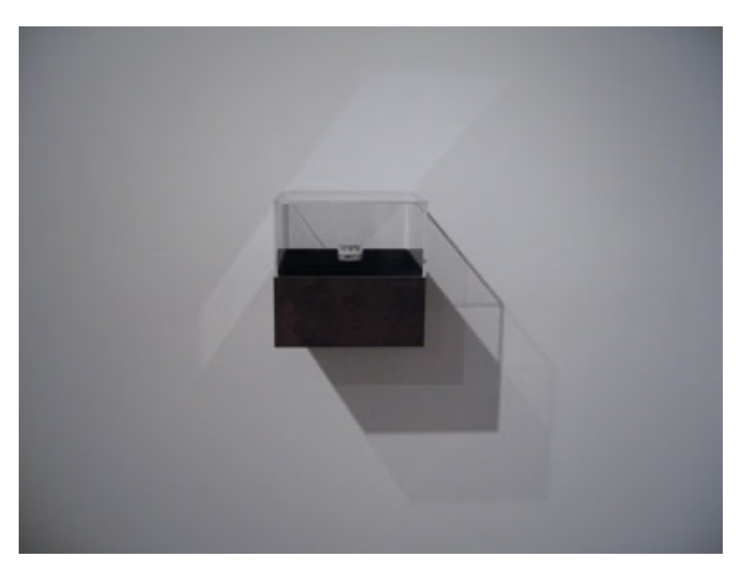
<detonator< i="">(Jimmy's old cell-phone in a vitrine).</detonator<>