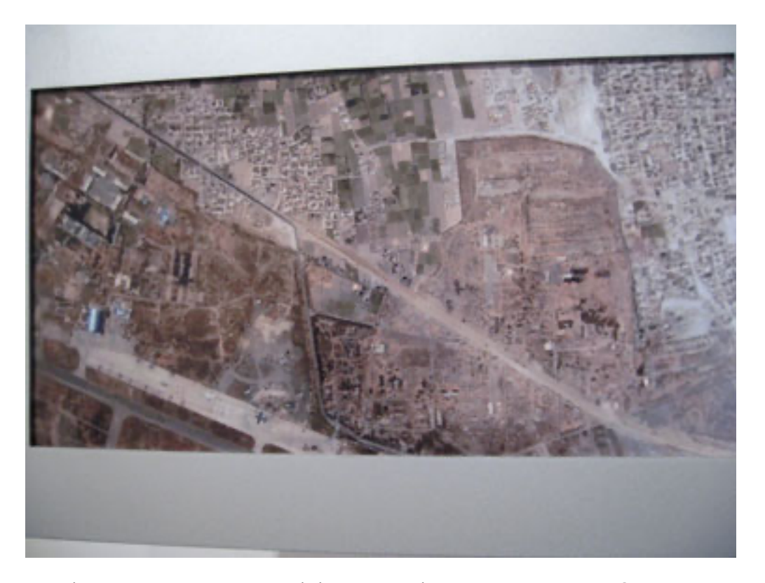
{\it Detail of flat-scrren\ TV\ containing\ a\ satellite\ photograph\ from\ \it Controlled\ \it Room.}